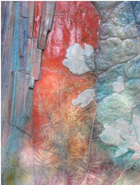
Detail: Underwater Garden