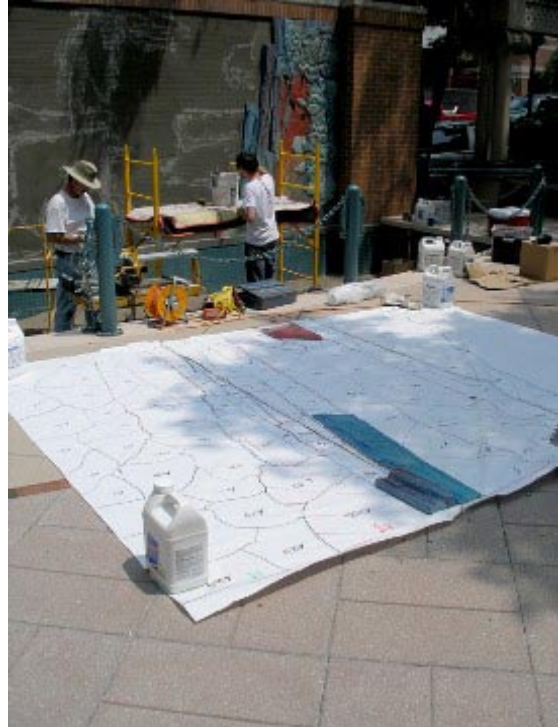
After being transported from upstate New York, the installers laid out the 500 individual, puzzle-like pieces on a numbered "map" to determine placement.